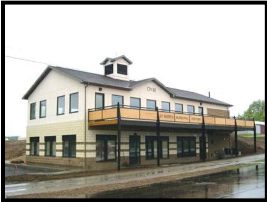
AIRPORT ADMINISTRATION BUILDING