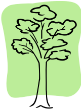
4th Grader Arbor Day Program Continues Each Year

In 2005 the Shade Tree Commission started an educational program with the 4 th grade students in the City. An ISA Certified Arborist from The Pennsylvania State University gives a presentation on trees to these students. This project continues each year.